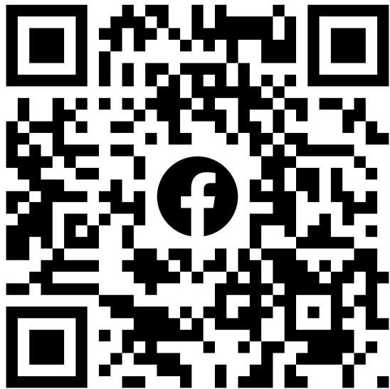
NTUCE International Student Group Facebook