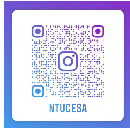
NTU Civil Engineering Student Association Instagram