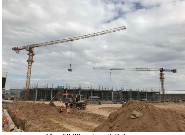
Fig. 10 The site of Saitex