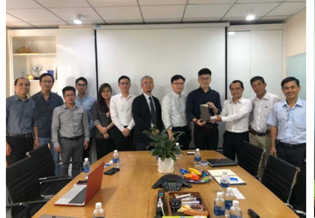
Fig. 25 Meeting for the first time at CPE

This trip means important to me a lot, not only for relaxing our pressure cause by academic research, but also give me the chance to think about my future career. But it still have some disadvantage need to improve in the future. First, I think the local university need to plan more specifically with two cooperate company in advanced. Both in language and case study before visiting, one is that there is less people in the construction site have the ability to speak English, and the other one I thought that maybe company can provide the information of the site we gonna visit to let us do the case study first. I thought that more reliance on communication and planning between each agencies.