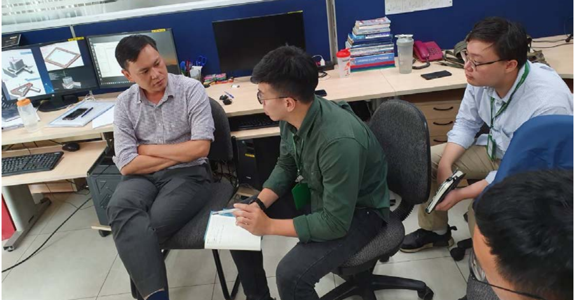
Fig. 13 Q&A