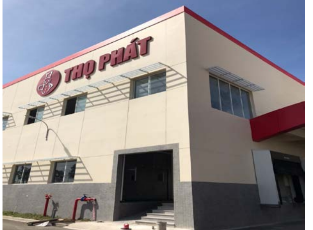
Fig. 9 View of the Tho Phat factory