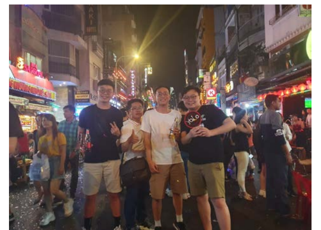
Fig. 17 The group photo