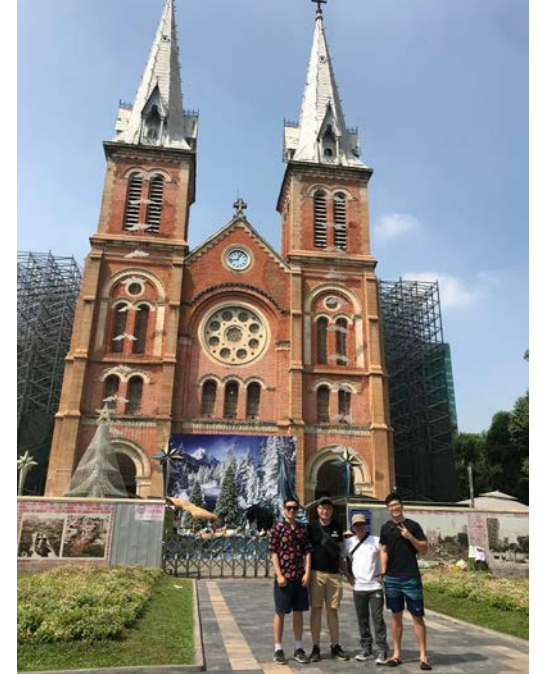
Fig. 22 Notre-Dame Cathedral Basilica of Saigon