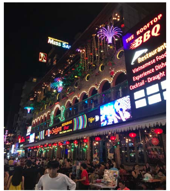
Fig. 16 The accident night club