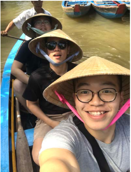
Fig. 21 Mê Kông river delta