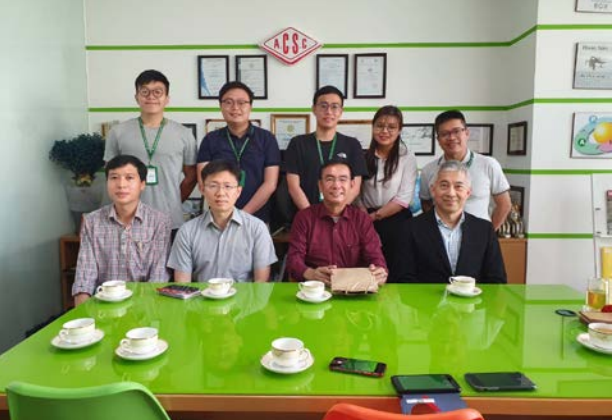
Fig. 26 Meeting at ACSC