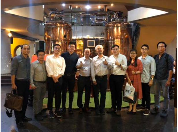
Fig. 27 Dinner with Professor from HCMUT