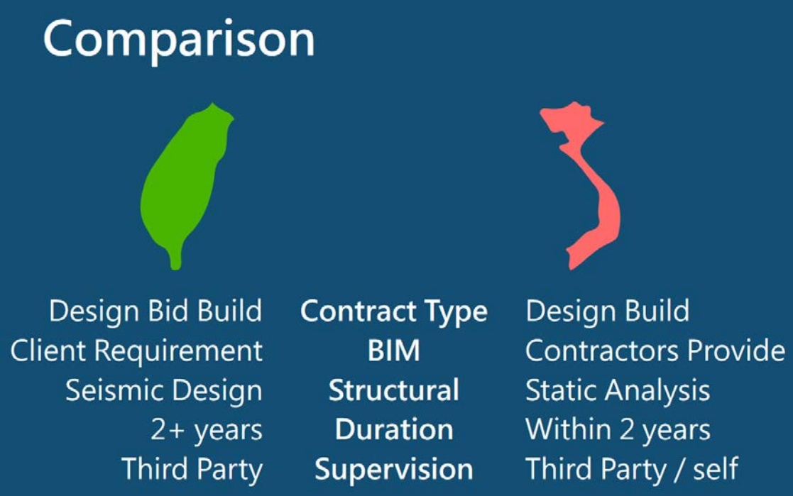
Table. 1 The comparison of project between Taiwan and Vietnam