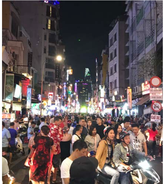
Fig. 15 Phạm Ngũ Lão (Foreign Street)

Fortunately, we have gone through the New Year during the VIP. It's a first time I lived this holiday abroad. So that I celebrated with our member of Group1 at the Pham Ngũ Lão (Foreign Street). When the final countdown is about to start, the sky began to fill with glitter and the spilled beer that was launched by tourists, and the passionate people start to cheer for the coming 2020 years. A little accident happened during the process. The fireworks set by the nightclub nearby us did not extinguish after the countdown is already over, it even burned the lateral signboard and almost lead to fire disaster. In the process of being extinguished, the masses command the employee of the club to remove where still have catching fire. When all the flame was removed, the crowd acclaim and say Happy New Year to each other. This is the moment that impressed me the most at this night. (Fig. 15 to Fig. 18)