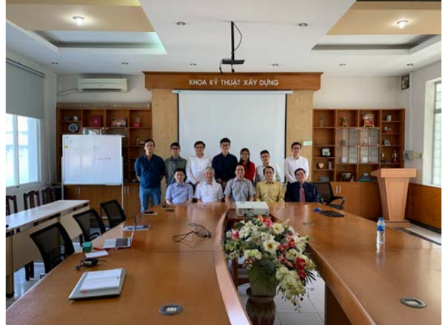
Fig. 28 Final presentation