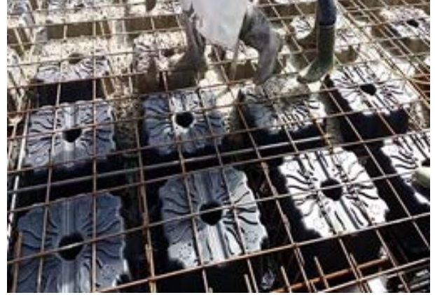
Fig. 7 Nevo Technology