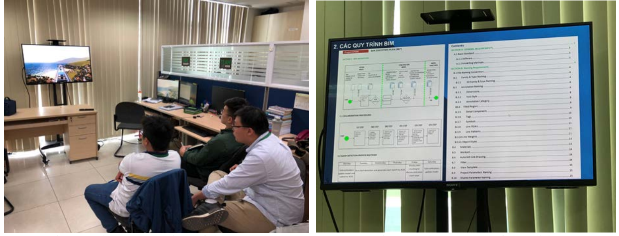
Fig. 11 The presentation of the BIM