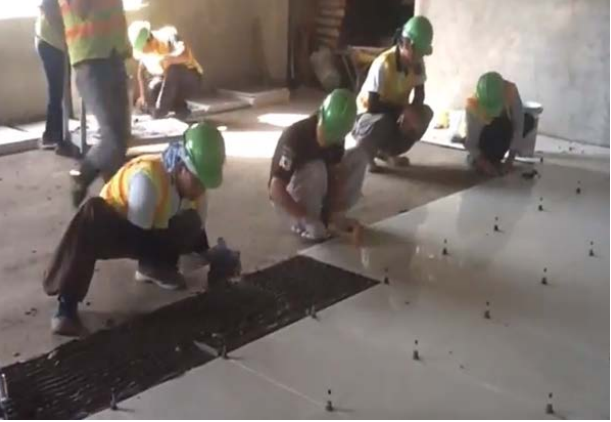
Fig. 8 Striving Method