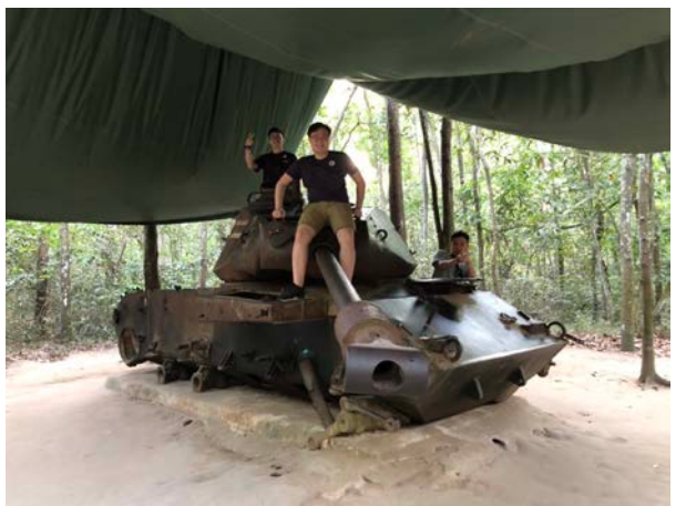
Fig. 19 Cu Chi Tunnel

These two weeks we also visit many tourist attractions, like Cu chi Tunnel, Mê Kông river delta, Saigon river and some spots in the HCMC. Despite relaxing the mind, we also learn about the local culture from above site, like war, communist party, food, custom, etc. What makes them turn into nowadays Vietnam. It is interested to me to observe about the scene mentioned above. (Fig. 19 to Fig. 24)