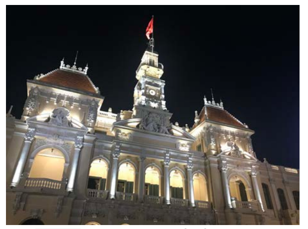
Fig. 14 UBND Thành phố Hồ Chí Minh

At there, on average, you see one or two car accidents a day. Even the ambulance often get stuck in the traffic jams. I think traffic is now HCMC need to put the most effort into to improve the current traffic situation. The improvement of transportation can correspondingly solve many other problems. Like reducing car accident, the time of going to work, the medical quality mentioned above.