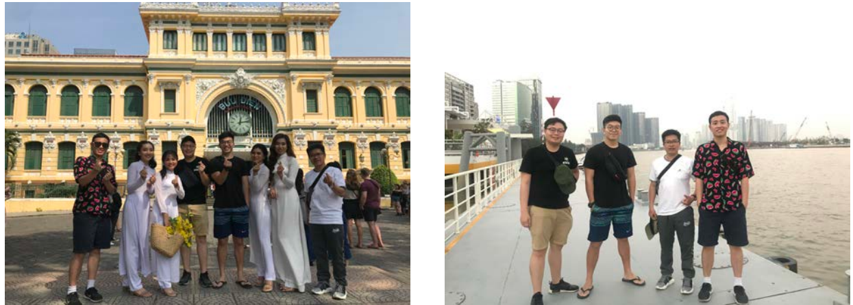
Fig. 23 Bưu Điện Trung Tâm Sài Gòn

Report Series of the Vietnam Internship Program 2019/2020 December 29, 2019-January 11, 2020, Ho Chi Minh City, Vietnam